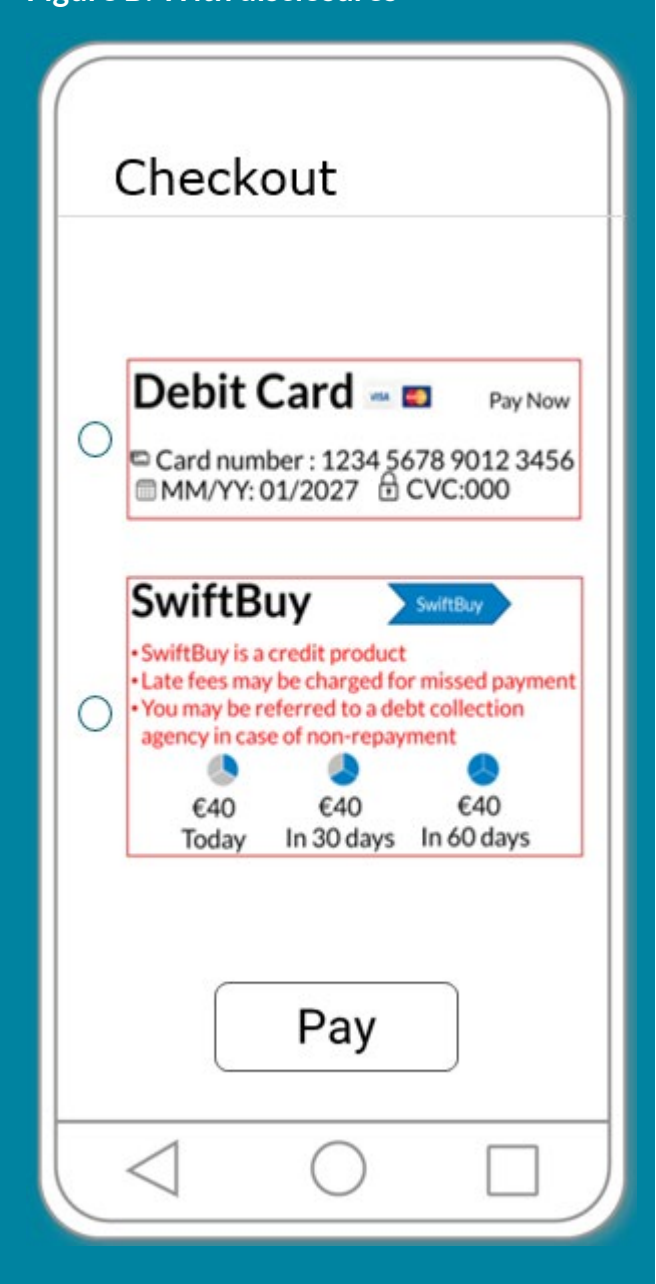
Figure B: With disclosures