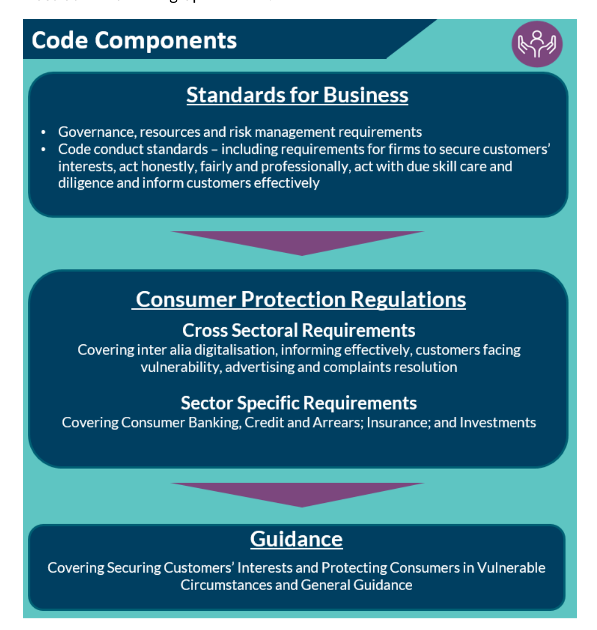
Figure 1 Consumer Protection Code Components

1.1.1 The Consumer Protection Code (the Code) is made up of a number of components including Standards for Business Regulations, Consumer Protection Regulations (comprising cross-sectoral and sector specific requirements) and guidance, as illustrated in the infographic below.